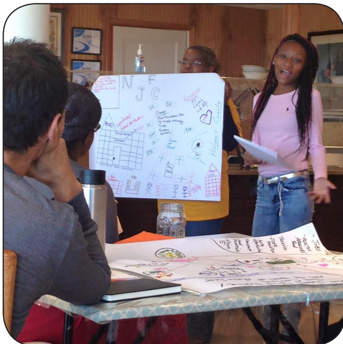
Participants from the Nollie Jenkins Family Center present the map they created that details the economic eco-system that exists in their local community.

We are trying out a one day crash course and a more in-depth two day version. Either of these can also be broken down into sessions and carried out over longer times. Our work with the US Solidarity Economy Network, the Center for Popular Economics, United for a Fair Economy and our new partnership with Beautiful Solutions and the many people and the many people and groups that are our base have guided and shaped this process. And we also want to recognize the contribution of 15 brilliant educator organizers, developers and radical economists doing transformative economy and governance work in the South and beyond who helped to create this process.