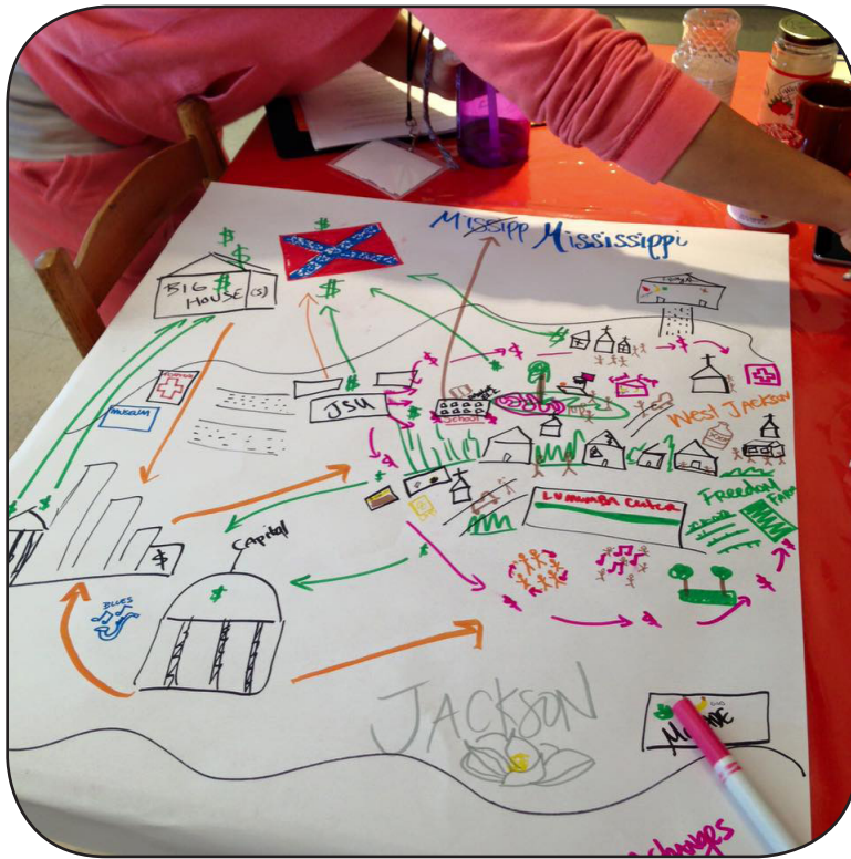
A community created map that details the many dynamics at play in the city of Jackson, MS.