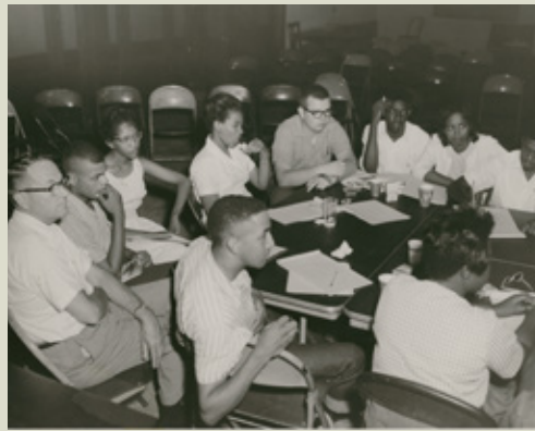
Meeting of Student Non-Violent Coordinating Committee (SNCC) at Highlander in Knoxville, 1960's.