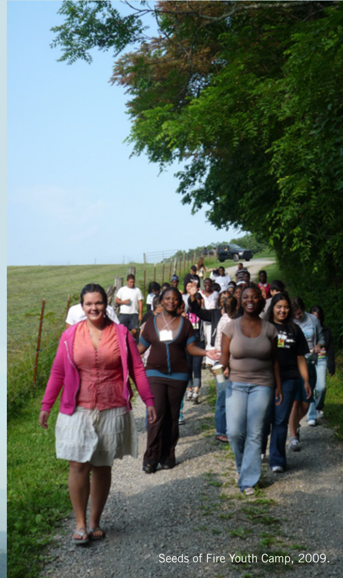
Seeds of Fire Youth Camp, 2009.

In 2011 we completed this trail loop on the east side of Bays Mountain. Future plans include trail sections on the north and west Highlander slopes.