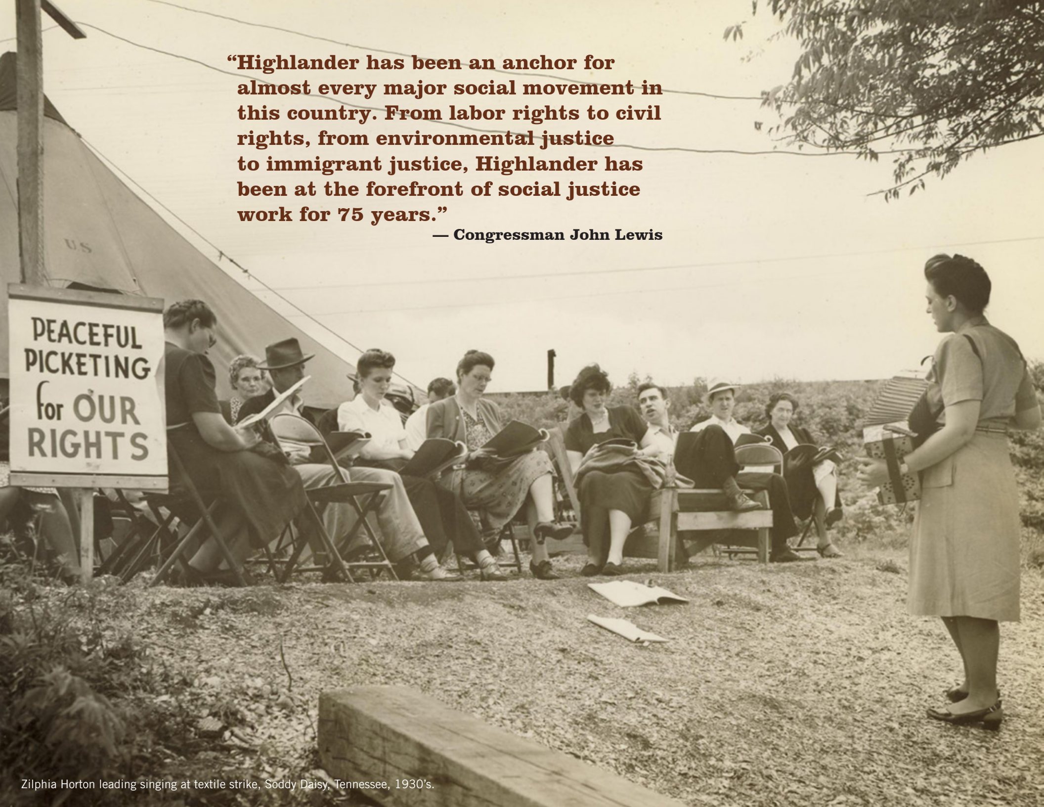
Zilphia Horton leading singing at textile strike, Soddy Daisy, Tennessee, 1930's.