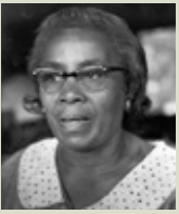
Septima Clark, Highlander's Director of Education in the 1950's.

Bays Mountain House provides housing for interns and staff. Future plans: following the Farm House renovation, Bays Mountain will house small scale, extended workshops, schools and residencies that can be run concurrently with The Workshop Center.