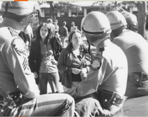
Strike at Stearns Mine, 1978.